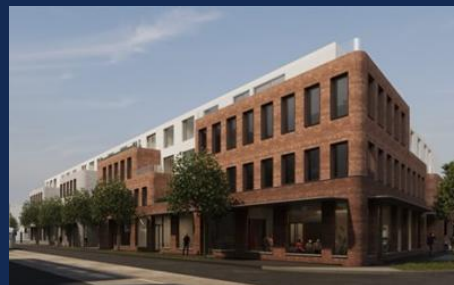
REGIS AGED CARE ESSENDON, VIC

Services Synergy were initially engaged for Development and Project Management services, to lead a consultant team through DA design and submission including a targeted value engineering focus to ensure an affordable DA scheme. Subsequently Synergy have been engaged as the Project Manager and Superintendent for the RFT and delivery phase of the development.