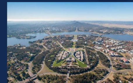
CAPITAL AIRPORT GROUP EVERLANES

Services Synergy were engaged for Project Management and Construction Advisory services to establish project finalisation planning, identify and mitigate key project completion risks and drive the completion of the precinct basement and the residential towers practical completions across multiple contracts and stages.