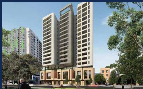
11 GIBBONS ST REDFERN, NSW