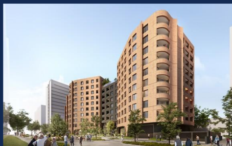
338 BOTANY ROAD ALEXANDRIA, NSW