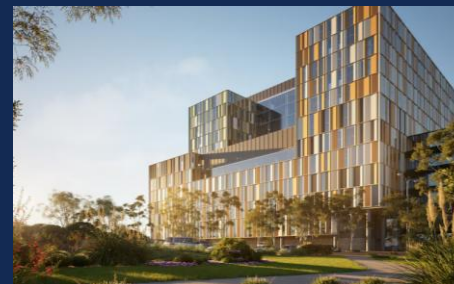
PERTH HOSPITALS NSW

Services Synergy were engaged to provide bid management services for the highly complex integrated project. Services included overall construction planning, methodology development and budgeting, program input & reviews, subcontractor tender management, project risk reviews and non-price schedule response preparation.