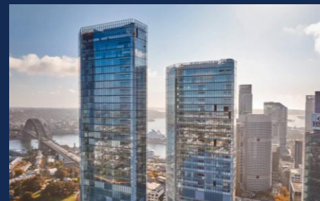
ONE SYDNEY HARBOUR SYDNEY, NSW

Services Synergy provided a comprehensive design report identified key risks and spatial arrangements, elemental composition, and configuration layouts. A benchmark study provided insights into site attributes, design, and regional market influences to guide future development. A high-level procurement strategy overview was developed to inform decision-making on future delivery models.