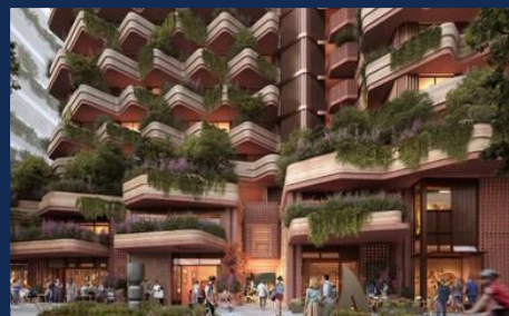
CASTLE TOWERS REDEVELOPMENT, NSW