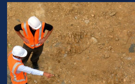
LAND AUDIT PROGRAM NSW

Services Synergy were engaged to provide Strategy & Bid Management services for 3 EOI submissions for Webuild. Each project required collaboration with local and international teams and included a focus on bid strategy, key win themes and analysing project success factors. Due to the delivery occurring in multiple jurisdictions, Synergy also had to undertake pre-qualification and application tasks concurrently to ensure the Contractor - new to the Australian market - was able to qualify to bid the works.